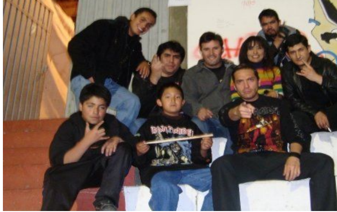
(La Paz, 2010)