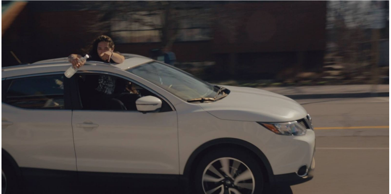
(Queen St, Streetsville, Canada, 2018)