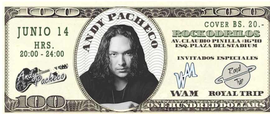
(La Paz, Bolivia 2018)